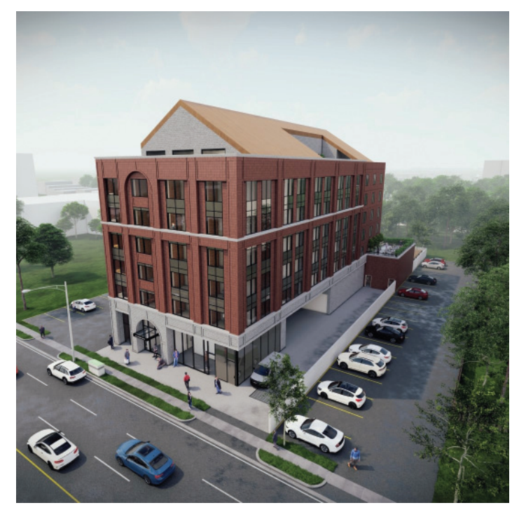
Architect's rendering of Mathias Place, Good Shepherd's proposed 95-unit residence for frail older adults with a history of homelessness.

Together, we can help frail seniors who struggle to remain housed. To learn more, please contact adrienne@goodshepherd.ca, 416.869.3619 x223.