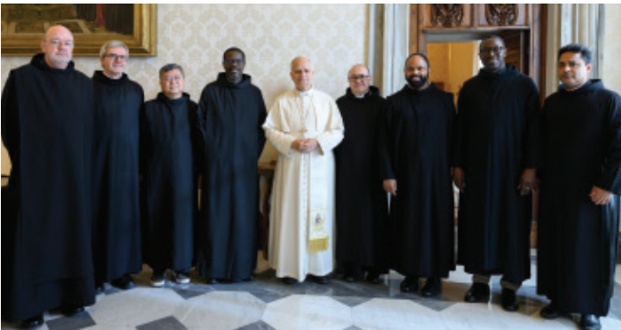
His Holiness Pope Leo with members of the SJOG congregation.

In a spirit of renewal and fraternity, Brothers from across the continent gathered in Los Angeles to map the future of the Mission of Hospitality in North America.